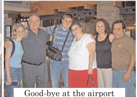
Good-bye at the airport