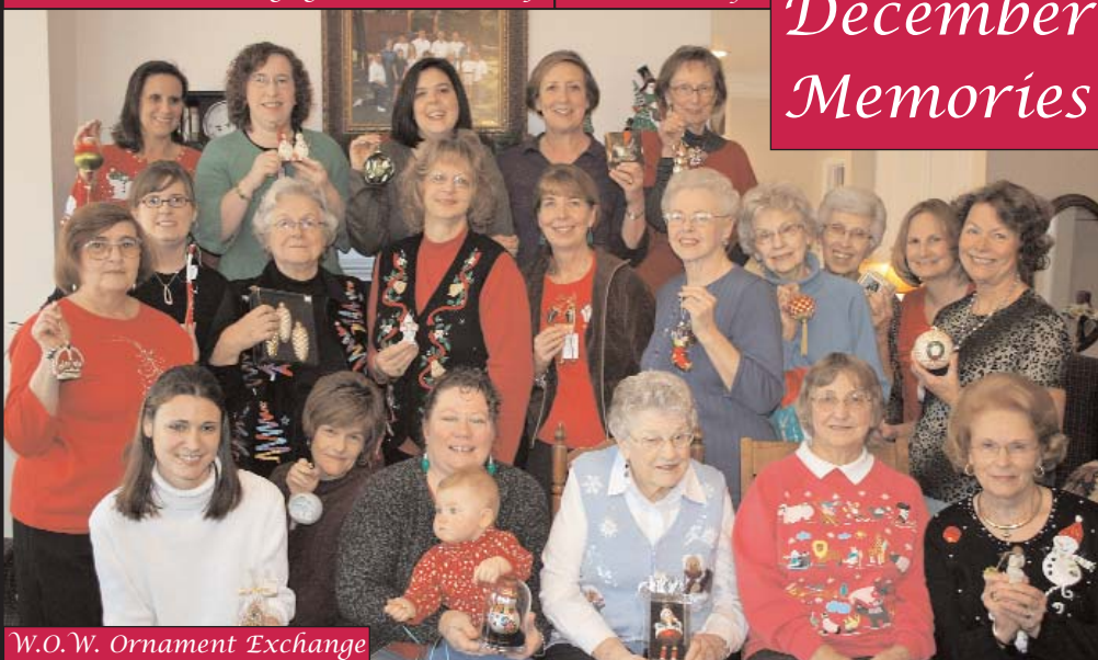
W.O.W. Ornament Exchange